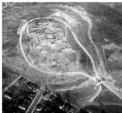
Aerial View of Fort Negley, 1937

Due to severe deterioration throughout World War II, the fort closed in 1945. Fort Negley Park remained in use for another 20 years.