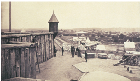
Fort Negley

Nashville's strategic location on the Cumberland River and networks of turnpikes and railroads made the city a valuable asset to both the Union and Confederate Armies. Following the surrender to the Union Army on February 25, 1862, Nashville became a fortified stronghold, second only to Washington D.C.