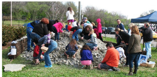
Fossils at the Fort Event, 2014

In 2014, Fossils at the Fort , an outdoor fossil collection site, opened in partnership with Vulcan Materials Company and Vanderbilt University Department of Earth and Environmental Science. The site encourages visitors to explore Tennessee's ancient marine past and to keep their fossil discoveries.